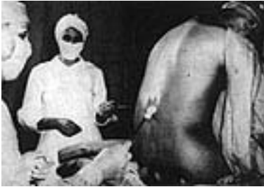
Nurses examine one of the Tuskegee syphilis study participants.

http://www.npr.org/programs/morning/features/2002/jul/tuskegee/